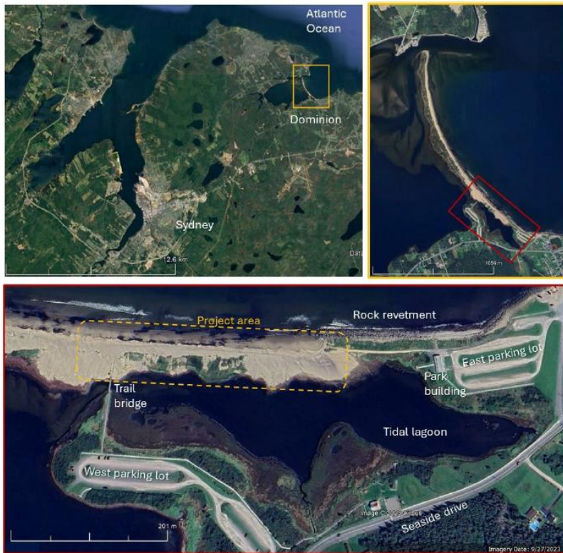
Figure 1. Aerial imagery of Dominion Beach Nourishment Pilot project area (Ref: Proponent.)

Approximate Coordinates: 46.215488°, -60.032613°