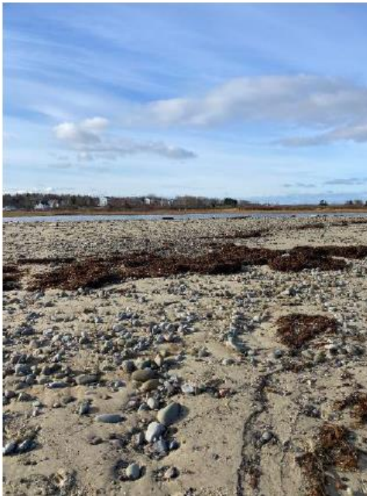
Figure 2. Photo 49: Start of Transect 7, facing south.